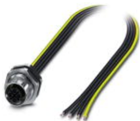
Flush-type connector, Power, 4-position, Socket, Link: M12, S power, Rear mounting, M16 x 1.5, Individual wires, Cable length: 0.5 m

Please be informed that the data shown in this PDF Document is generated from our Online Catalog. Please find the complete data in the user's documentation. Our General Terms of Use for Downloads are valid ( http://phoenixcontact.com/download )