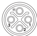
Pin assignment of M12 socket, 4-pos., S-coded, socket side view