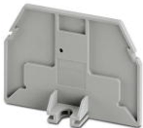
End cover, length: 53.3 mm, width: 2.2 mm, height: 37 mm, color: gray

Please be informed that the data shown in this PDF Document is generated from our Online Catalog. Please find the complete data in the user's documentation. Our General Terms of Use for Downloads are valid ( http://phoenixcontact.com/download )