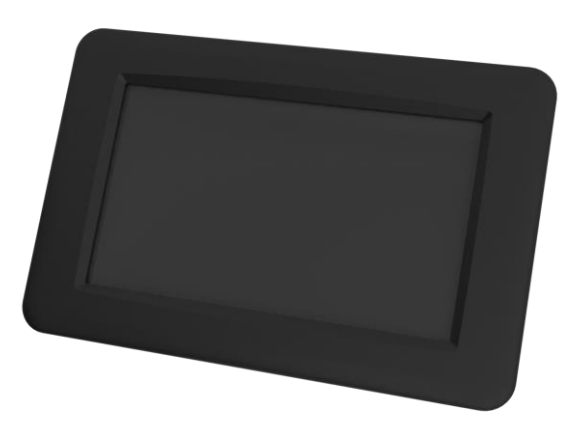
4DLCD-FT843 Mounted in 4.3" Bezel - Front