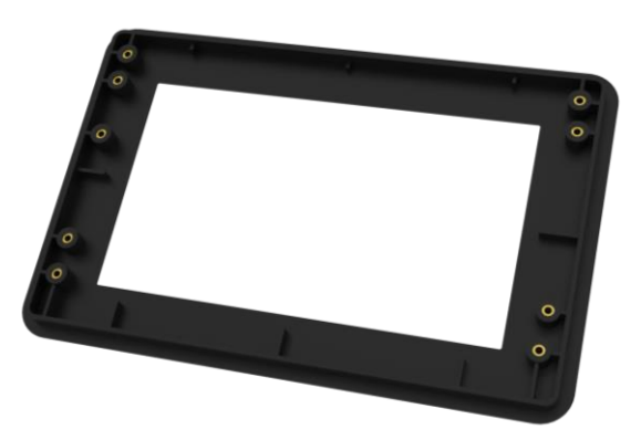
Bare 4.3" Bezel - Back