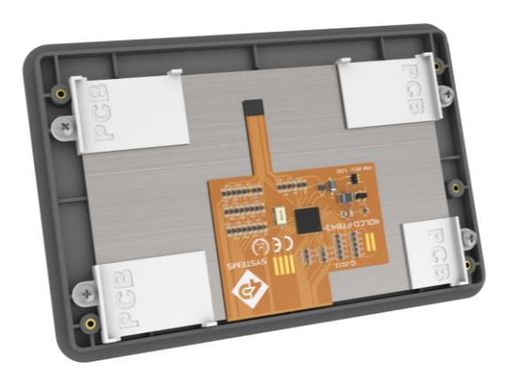
4DLCD-FT843 Mounted in 4.3" Bezel - Back