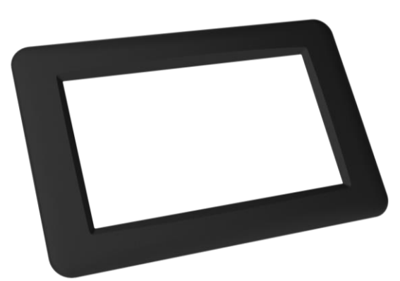
Bare 4.3" Bezel - Front